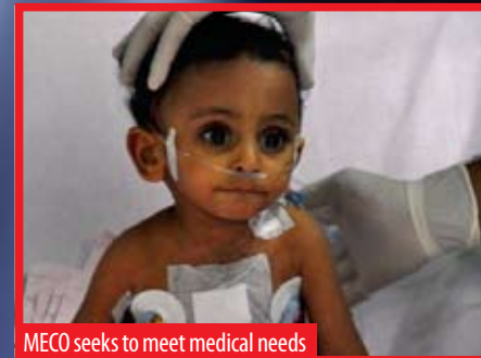
MECO seeks to meet medical needs