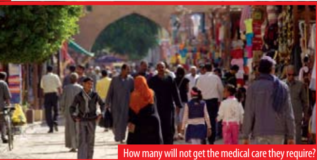
How many will not get the medical care they require?