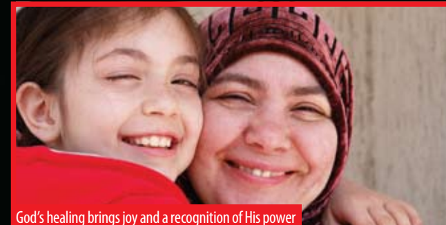
God’s healing brings joy and a recognition of His power