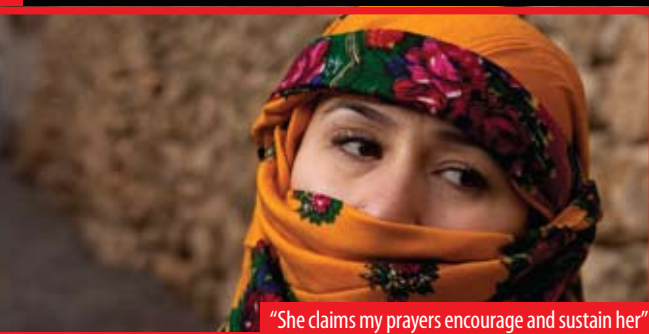
"She claims my prayers encourage and sustain her"

Find out more by visiting www.30-days.net/order